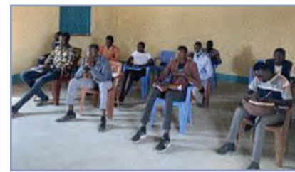
Aweil Bible College Students

Second update is about ABC, the college resumed its operation immediately after a meeting with the team in the USA. Studies started September