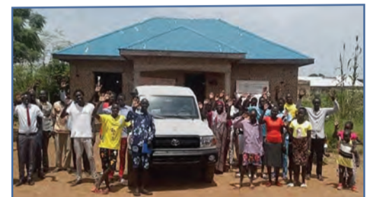
Christians giving praise to supporters who's giving helped purchase the mobile medical vehicle

It is my pleasure to now take this opportunity to report to you about the Churches of Christ and their activities.