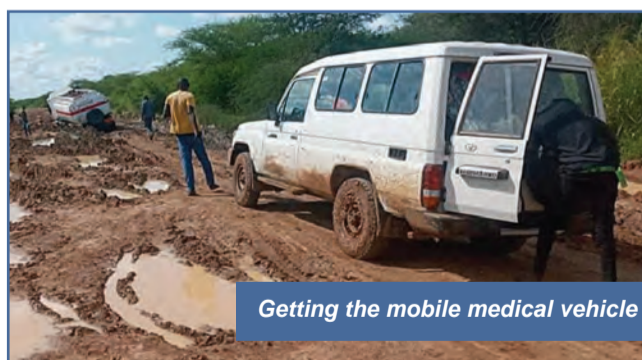
Getting the mobile medical vehicle to Malek was not an easy task!