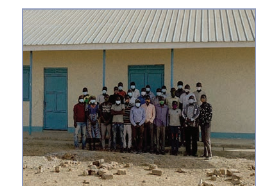
Students in front of Aweil Bible College in Malek, South Sudan

We are praising the Lord for the glory and grace.