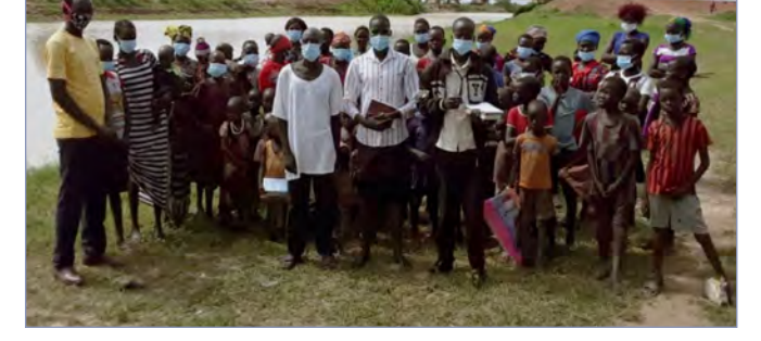
Wathmuok Church of Christ members after the baptisms

additional $25,000 from IDES (International Disaster Emergency Service). $45,000 has been wired to be used for Personal Protection Equipment, food and medicine. We praise