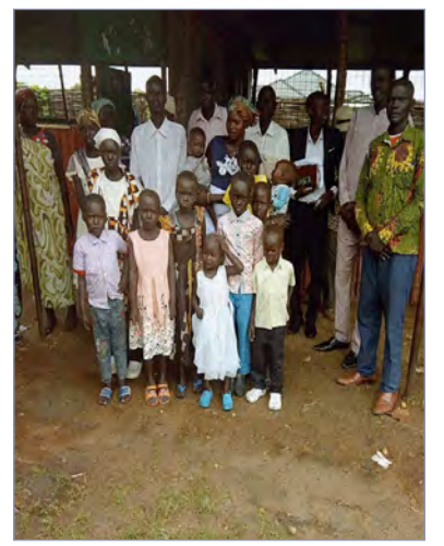
Some of the church members in Juba, South Sudan

The Church of Christ in Juba is sending their greetings to USA churches. We are very happy about what you are doing for the name of our Lord Jesus Christ.