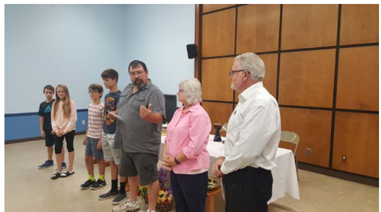
Some of the youth from St. Helens, OR with their leader presenting their check to SSAM

I have been reminded over the last few days of the amazing people God calls to become partners in our mission to South Sudan. A couple with a daughter starting college and a new house under construction recently gave $3000 and pledged to give $7000 more over the next year. They want to help us EXPAND . EXPAND is a plan to raise an additional $100,000.00 to expand our influence in South Sudan by purchasing land in Juba and establishing a Bible school in Maiwut County. A lady in Molalla, OR, decided to help by doing a garage sale. She donated more than a thousand dollars! Another lady from Pennsylvania sent $645 with "EXPAND" in the memo line. The youth group from The Christian Church in Saint Helens, OR raised $5500,00 for a well in Apada. They did pie socials and a spaghetti feed. Their funds will be combined with a gift from the Poor Box ministry at Faith Christian Community in Anchorage, Alaska. Faith has an offering box at the front of their auditorium with a sign that says, "remember the poor." Money from the box is used to meet pressing needs all over the world. God allows South Sudan African Mission to partner with some of the greatest people in the world, and we are very grateful to Him and to all of you! What is God prompting you to do to help EXPAND His kingdom?