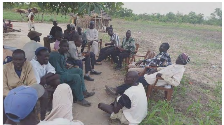
Community evangelism in village

We thank almighty God who made it possible for us to have a Church building at Malek, this building was completed through the small funds we have been saving from our Aweil budget which come from SSAM and our congregation contributed heartily by making bricks for the building.