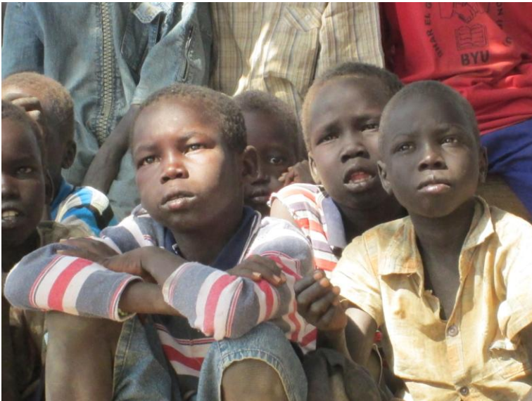
A few of the many children in the Malek, South Sudan area