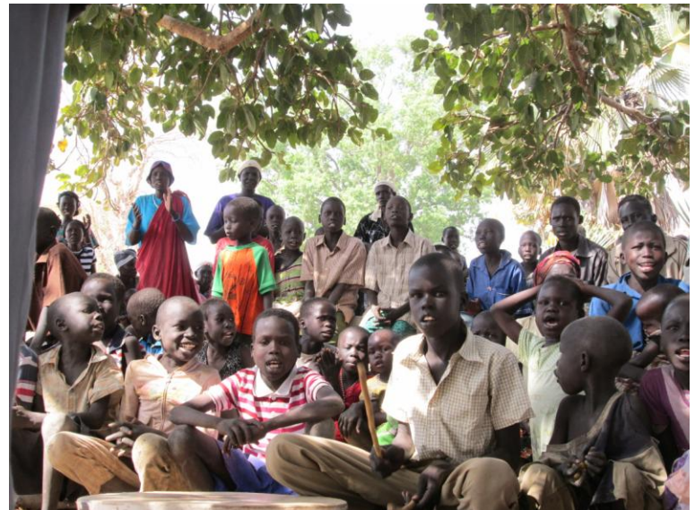
People from the village greeting the SSAM team

The walls are built at the CALS compound already in addition to fence poles and wire fencing around the compound, two classrooms, one kitchen and one administration office have also been built. Funds are needed for the roofing before the rainy season begins.