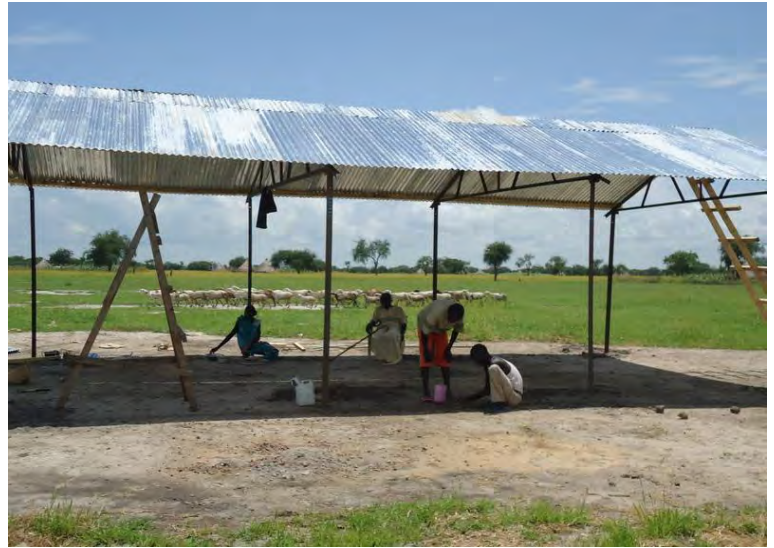
Beginning construction on the church building in Atar, South Sudan which is now nearly completed