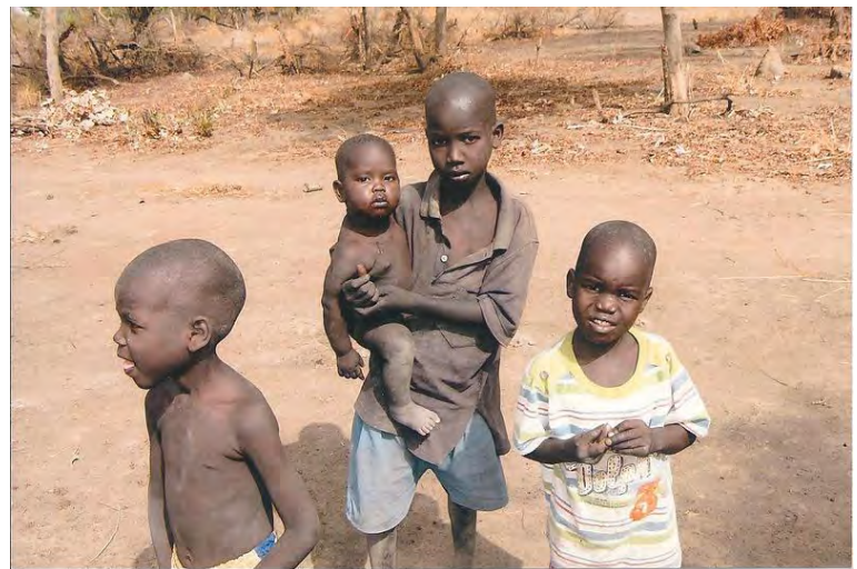
Orphan children in Malek, South Sudan