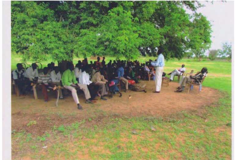
Yournew meeting with the evangelists in Malual Bai

Bulamom is a newly planted church. 75 converted members have been oriented to Bible studies, worship, Sunday School and the importance of prayer.