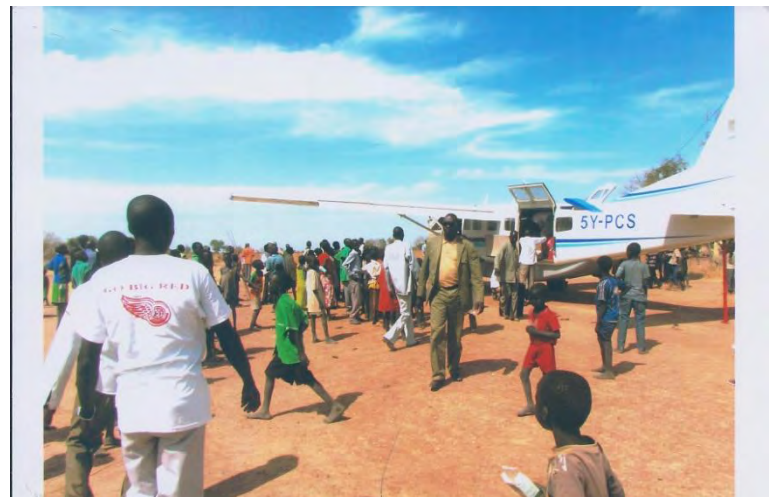
Medicine purchased with IDES funds arriving in Malek, South Sudan. The medicine will be used at the Malek Christian Hospital.