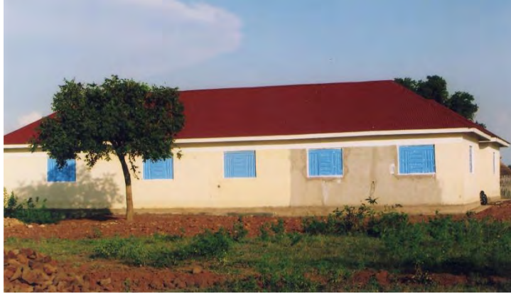
Malek Christian Hospital