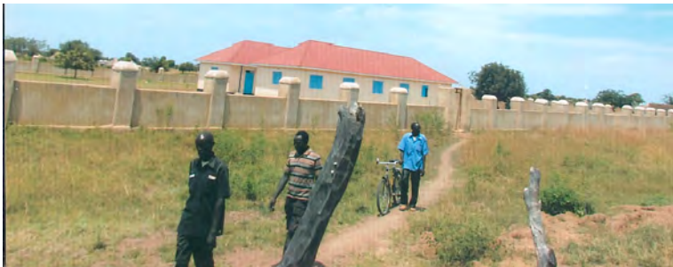
Above is the well worn path to the back door of the Malek Hospital bring food, counseling and supplies to the sick.