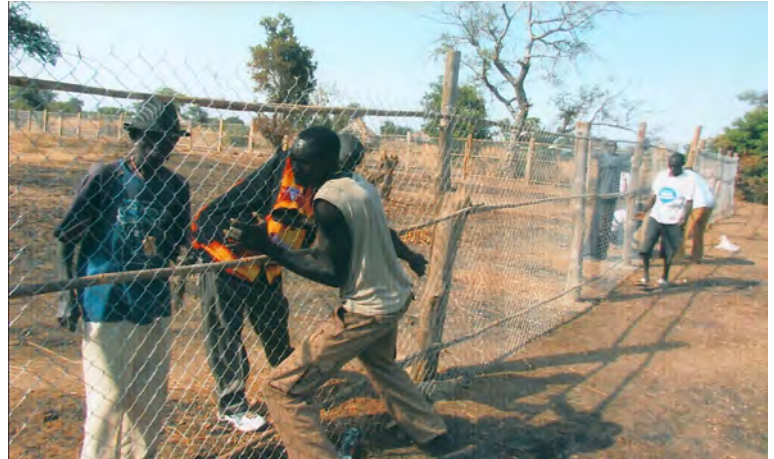
Above Building the fence at the Children's Ranch YOURNEWS WOL'S REPORT FROM SUDAN

Pray for The Church in Sudan and the SAM Directors.