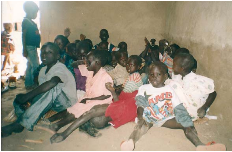
Above: Street Orphans are being fed, clothed and housed daily at the Malek compound. Hundreds stagger in every day in need of food, blankets or medicine. This group, who are rejected in North Sudan, have been fed along with the Aweil Bible College students at the Malek Compound for over a year. There are eleven workers on the compound staff counting five medical staff and six staff preparing food for 100 people daily.

Paul's comment. Do you see the influence of Christianity in this anthem?