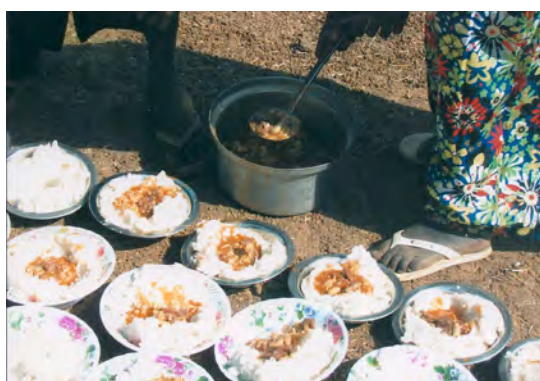
Food being prepared for 360 orphans at the Panmeth Peryam Ranch with no kitchen built yet. Father, Your Church is trying to do the best we can. Amen