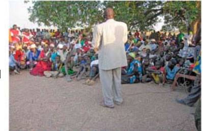
YOURNEW PREACHING TO HIS PEOPLE SUNDAY AM

Dear on behalf of the Bread of Life Project, I would like to express my appreciation toward you and our donors for the wonderful job they have done. Concerning the twenty (20) ox plow,