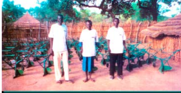
Pictured are the 80 plows sent in 2004.

In recent years, flooding has been an issue during the rainy seasons, destroying many of the crops. Those with plows were able to replant after flood waters subsided and were still able to produce a crop.