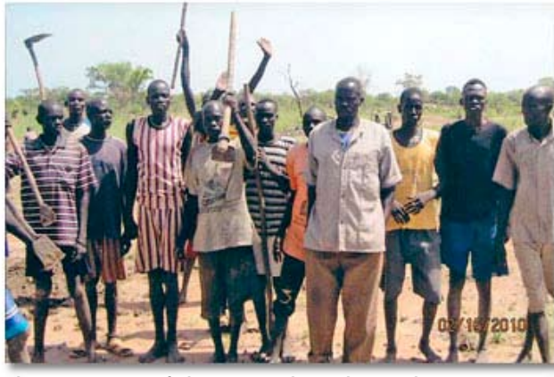
Above is a group of Christian workers who are clearing trees from a 30 acre field to plant food for the poor widows & children.