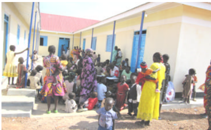
Multitudes celebrating the opening of the Hospital.

Many churches were established by Malek as the mother church and as the church grows, its needs both spiritual and physical help. It also grows bigger and sometimes complex. At the moment all our Evangelists are working in the new churches and facing lots of challenges to meet their basic daily needs and we pray and kindly request for support to enable them to buy food for themselves and their family as they work for the Lord in their ministry."