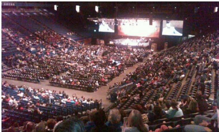
NATIONAL MISSIONARY CONVENTION IN LEXINGTON, KY

Web page: http://SudanAfricanMission.org E-mail sampdouglass@comcast.net