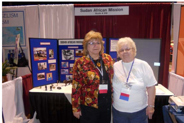
Hundreds came by our booth, many with words of encouragement.

Jan. 11, South Sudan is to go to the polls and vote to be a Democratic Nation. 18 million will be given opportunity to vote to stay under Islamic or a democracy rule? All 18 million want a democracy. A huge Multitude have taken their stand in Sudan under the flag of Jesus Christ.